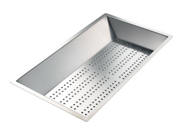
Stainless steel perforated tray 8151 000

Graters kit with ring-holder and food collection tray 8159 101