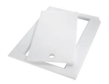
HPDE twin chopping board 8644 100